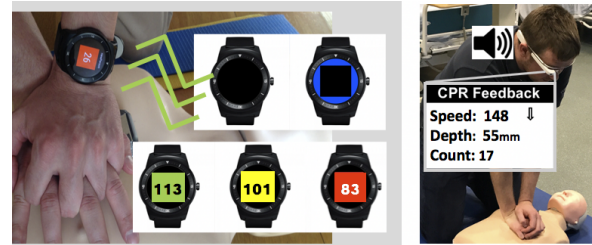
Figure 1. CPR Assistant Devices: Watch (left) and Glass (right) providing instant feedback on compr. depth and speed while performing CPR

numeric visual feedback (see figure 1, right). On start, the Glass begins to click in an audible sound with an average required speed for CPR. While performing CPR, the display of the Glass provides the current compression speed, and also (if necessary) prompts the user to slow down or speed up with arrows next to the compression frequency. The compression depth is also shown in the display.