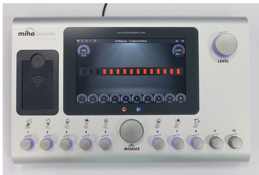
FIGURE 1 | WB-EMS device miha bodytec 2.

Sample size was calculated using G*power 3.1.9.4 (university of Düsseldorf, Germany). With an effect size of 0.25, total sample size was calculated by 36 participants (Faul et al., 2007). With regard to possible drop-outs, more participants were admitted to the study. Statistical evaluation and graphics generation were executed using IBM SPSS (SPSS Version 25.0, Chicago, IL, USA). The normal distribution was verified by means of the Shapiro-Wilk test. Because of this criteria, to check the maximum intensity tolerance index development, the four test times T1–T4 were analyzed by means of